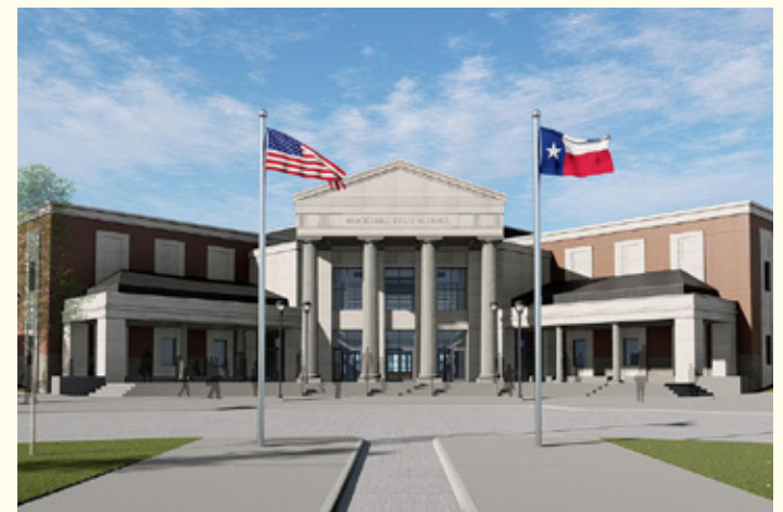
Rock Hill High School - Opening 2020